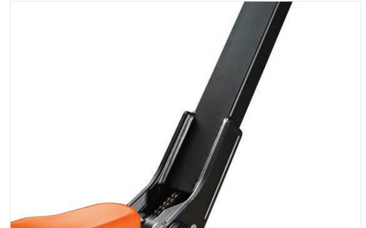
Robust robot-welded tow bar