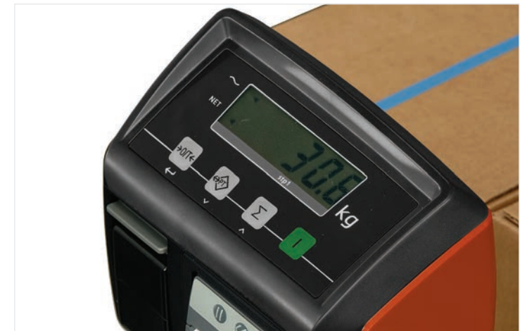
Weighing the load as part of the normal handling process increases productivity