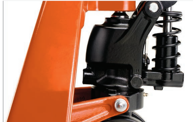
Strong adjustable valve rod and twin ball bearings