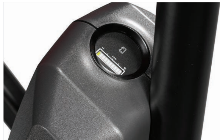
Battery indicator (HHL100)