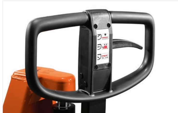
Comfortable enclosed handle