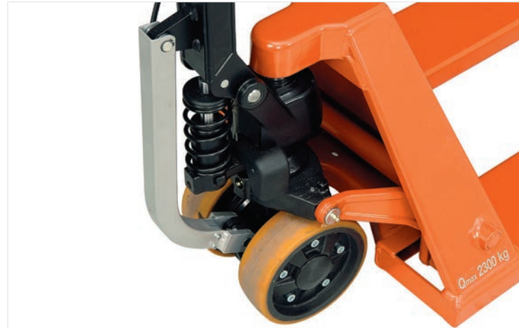
The BT Pro Lifter's steering arm provides leverage to the wheels to help get the truck moving