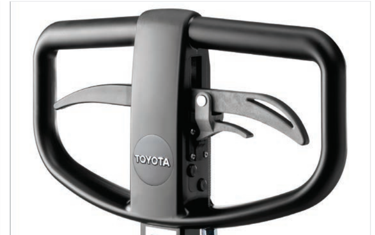
This is engaged by the manual control lever on the handle