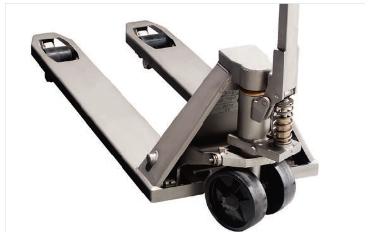
Stainless steel LHM200ST designed for corrosive environments