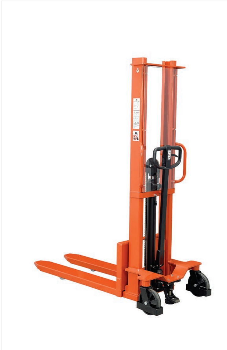
SHM080 manual version