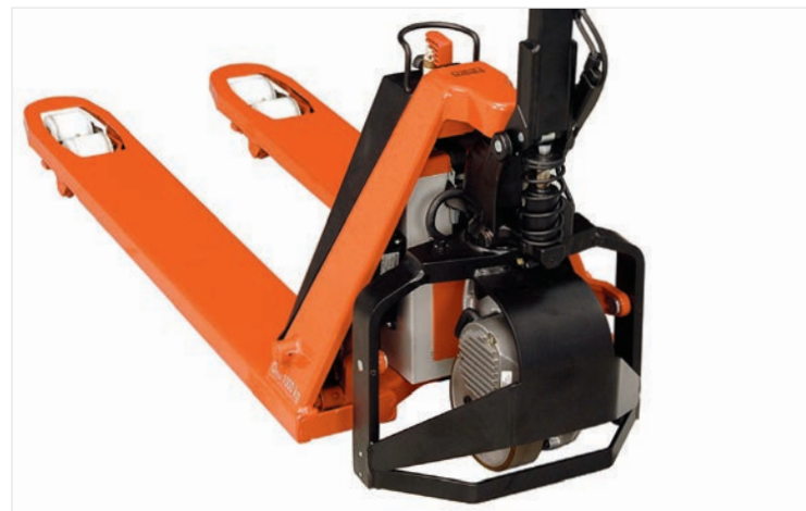
The LHT100's motor and battery are compact enough for it to be as manoeuvrable as a standard BT Lifter